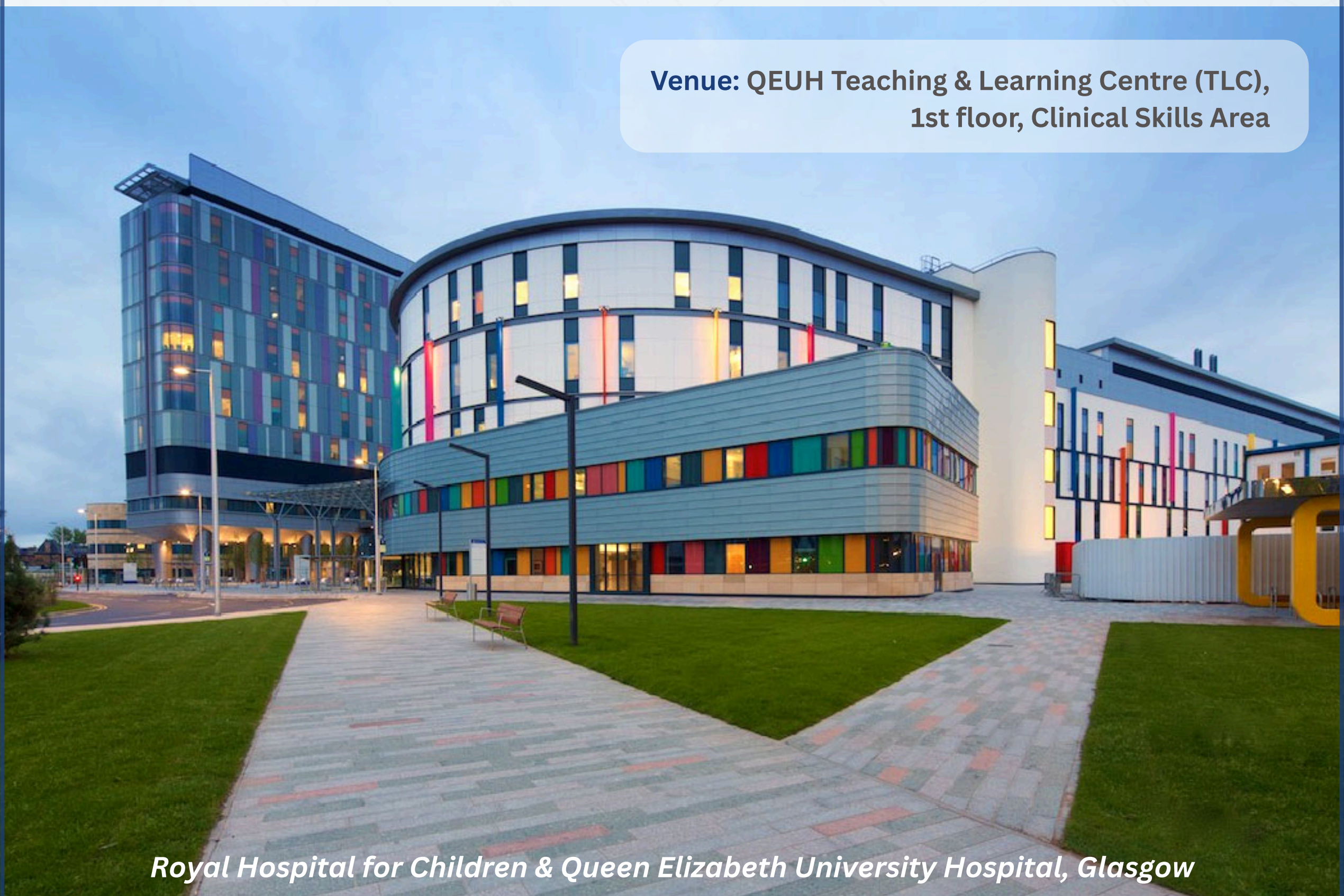
Royal Hospital for Children & Queen Elizabeth University Hospital, Glasgow

Venue: QEUH Teaching & Learning Centre (TLC), 1st floor, Clinical Skills Area